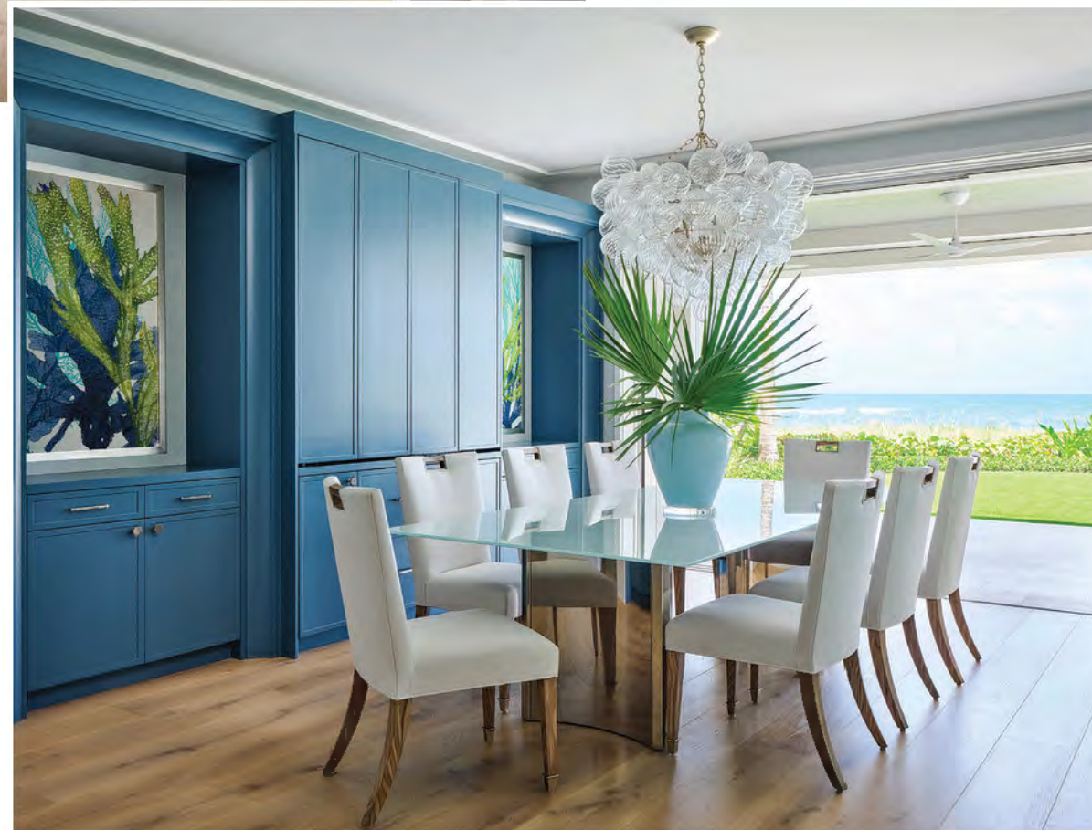
A bold floral wallpaper adds character to the mudroom; blue built-in cabinets and a chandelier of handblown glass balls in the dining area echo the ocean waves outside.

Large, locally purchased watercolors in the dining room and a small work of art from the owners’