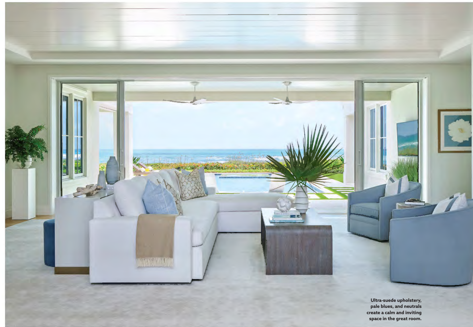
Ultra-suede upholstery, pale blues, and neutrals create a calm and inviting space in the great room.

and functional kitchen, multiple seating areas, and public and private rooms with access to the outdoors were also priorities.