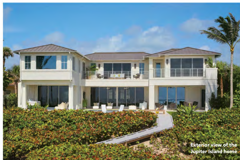
Exterior view of the Jupiter Island home