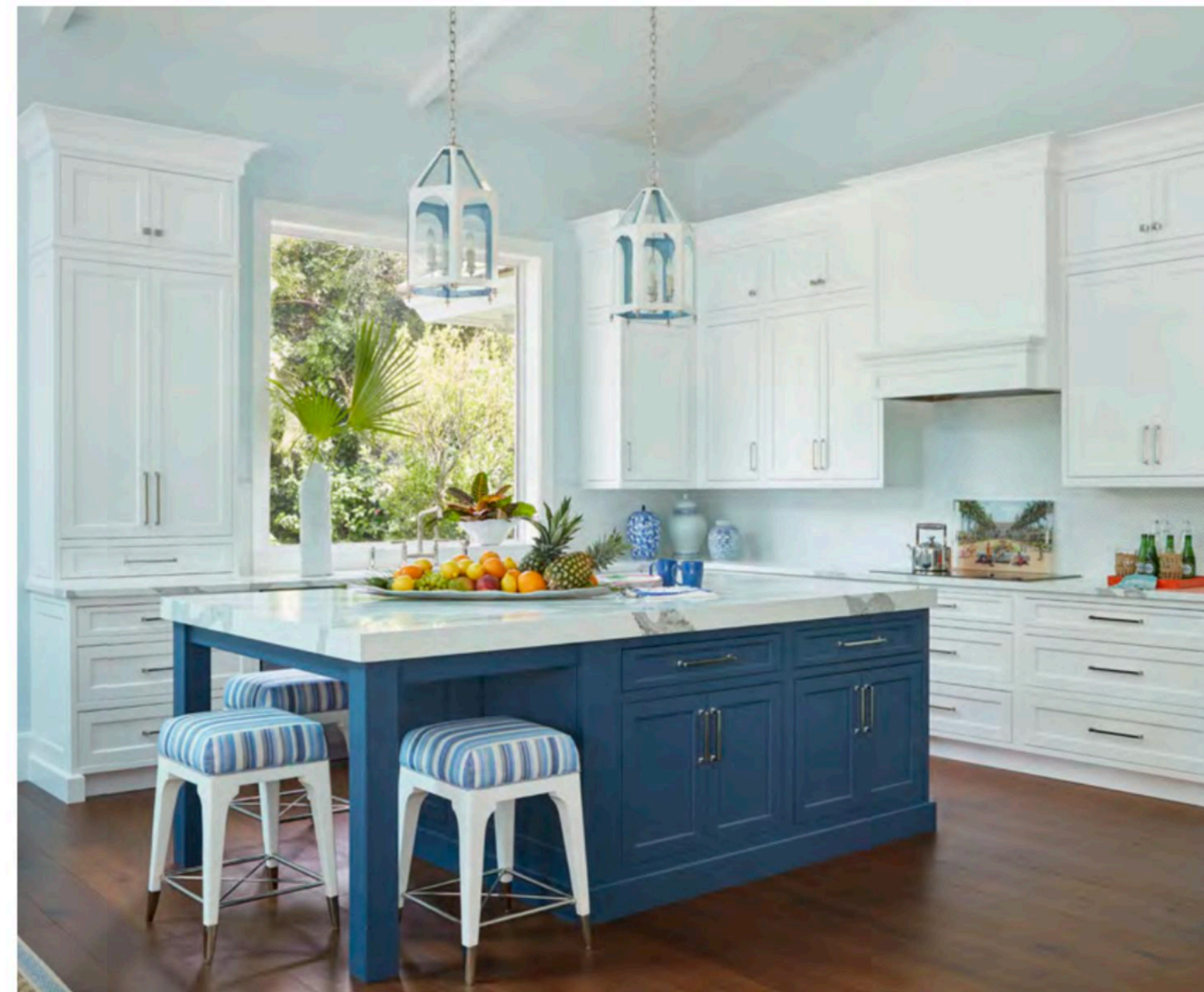
Armour loves a white kitchen but uses color to add some pizzazz.

When color is used well it can work anywhere including on a home's front door. "People are getting much more comfortable using color," said Armour.