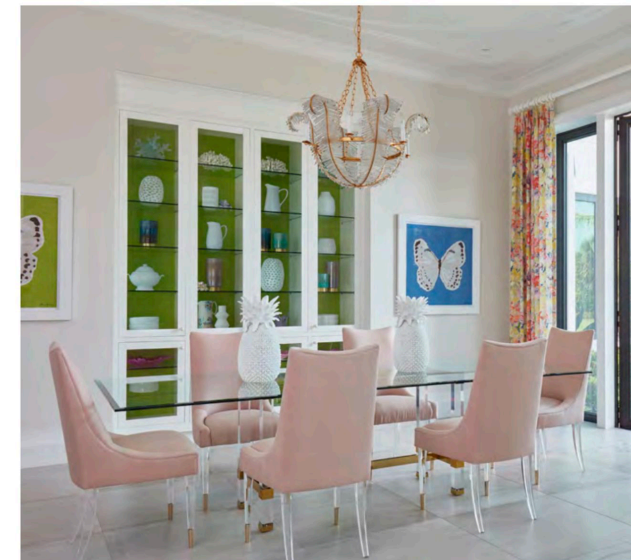
The dining room has pink faux-silk linen covering the chairs with lucite legs and antique brass details. They are paired with a contemporary glass table. The backdrop of the built-in was painted lime green to add some drama. The Visual Comfort chandelier is antique brass with crystals made to look like feathers.

2 Whatever the design, selecting the right color is a priority. There is tremendous power in color. It grabs the attention. It plays a vital role in design. It can draw the eye to a specific place in a space. Color often triggers feelings and certain hues can evoke specific emotional responses.