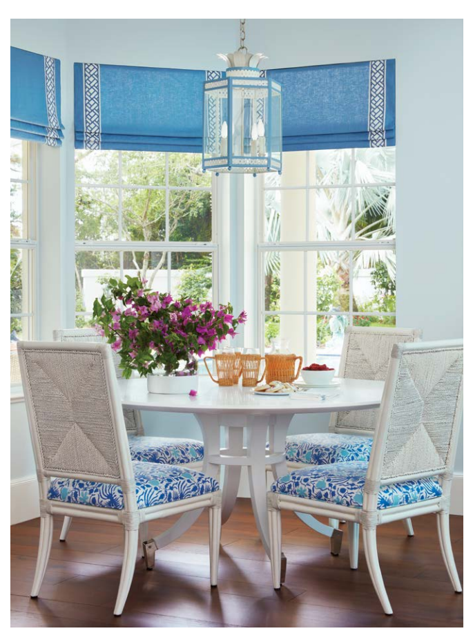
ABOVE: The breakfast room continues the classic blue and white color scheme with crisp window treatments. Indoor/outdoor fabric covers the seats of the painted chairs. The custom light is a reverse blue and white variation of the pendants in the kitchen.

RIGHT: Since the laundry room is the first room you see when entering from the garage, a bold navy and white China Seas wallpaper is paired with a striped, penny-tile floor chosen by George Ross.